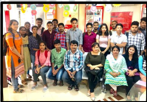
Students and faculty at Jetking Networking Centre

6. An Industrial visit to Jetking Sadashivnagar Learning Centre., a division of M/s. Manor Information & Management Services Pvt. Ltd for the sixth Semester students on 02 nd and 3 rd of March 2019.